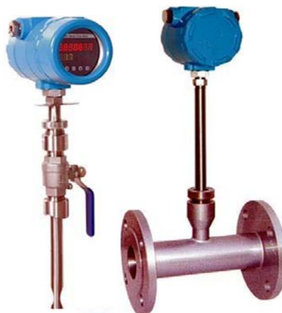
Figure 2: Compact Type

The sensor, transmitter, display are integral, Power supply can be 220VAC or 24VDC. The display unit can display instantaneous flow and totalized flow, set alarm point and output 4-20mA.