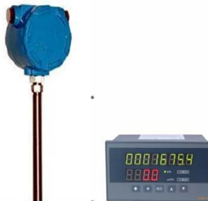
Figure 3: Remote Type

The sensor, transmitter, and display are not integral. The display unit can display instantaneous flow and totalized flow, set alarm point and output 4-20mA. The two parts are connected by three wires, and the transmitters are 3 wire type.