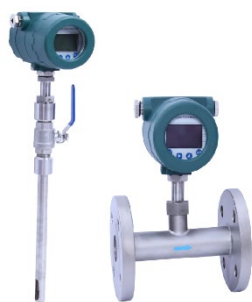
Figure 2: Compact Type

The sensor, transmitter, display are integral, Power supply can be 220VAC or 24VDC. The display unit can display instantaneous flow and totalized flow, set alarm point and output 4-20mA.