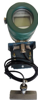
Figure 3: Remote Type

The sensor, transmitter, and display are not integral. The display unit can display instantaneous flow and totalized flow, set alarm point and output 4-20mA. The two parts are connected by three wires, and the transmitters are 3 wire type.